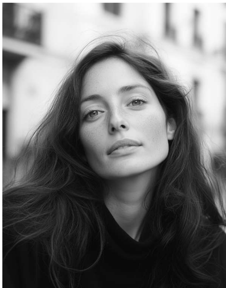
ILFORD PAN F 50