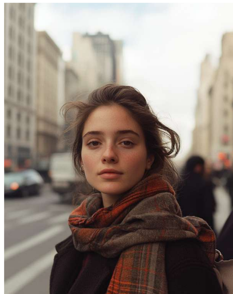
KODAK VISION3 500T