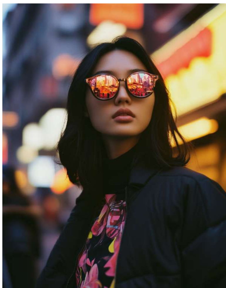
LOMOGRAPHY X-PRO SLIDE