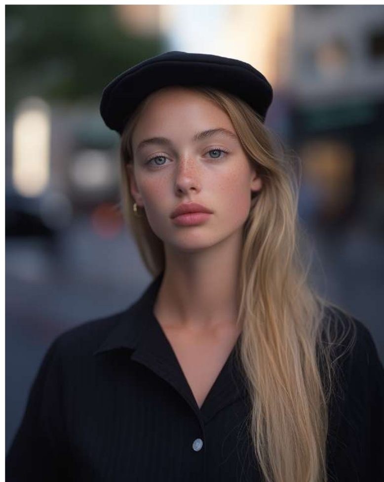
FUJIFILM VELVIA 50