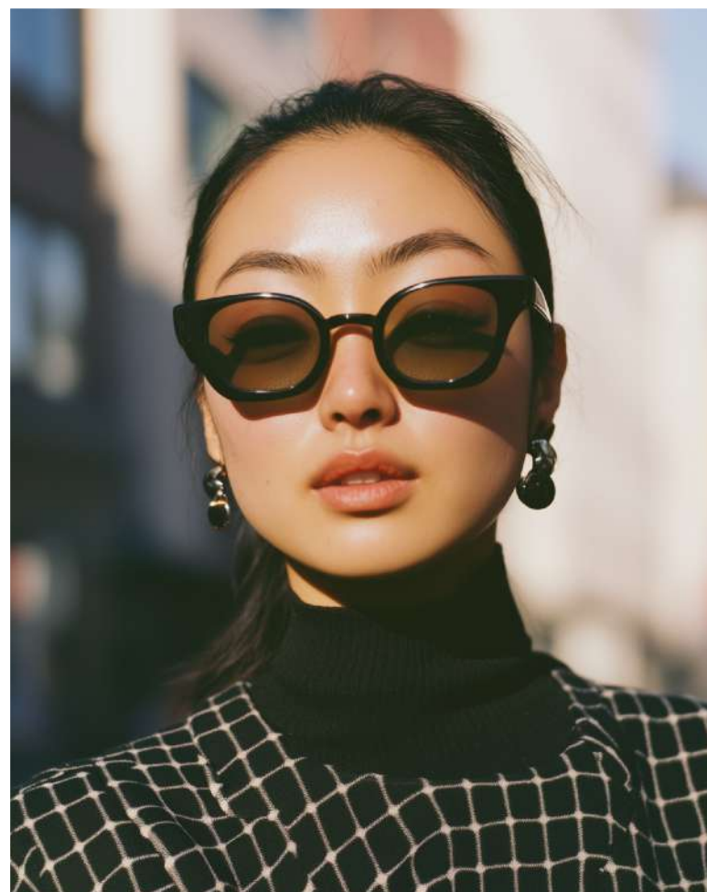
AGFA VISTA 400