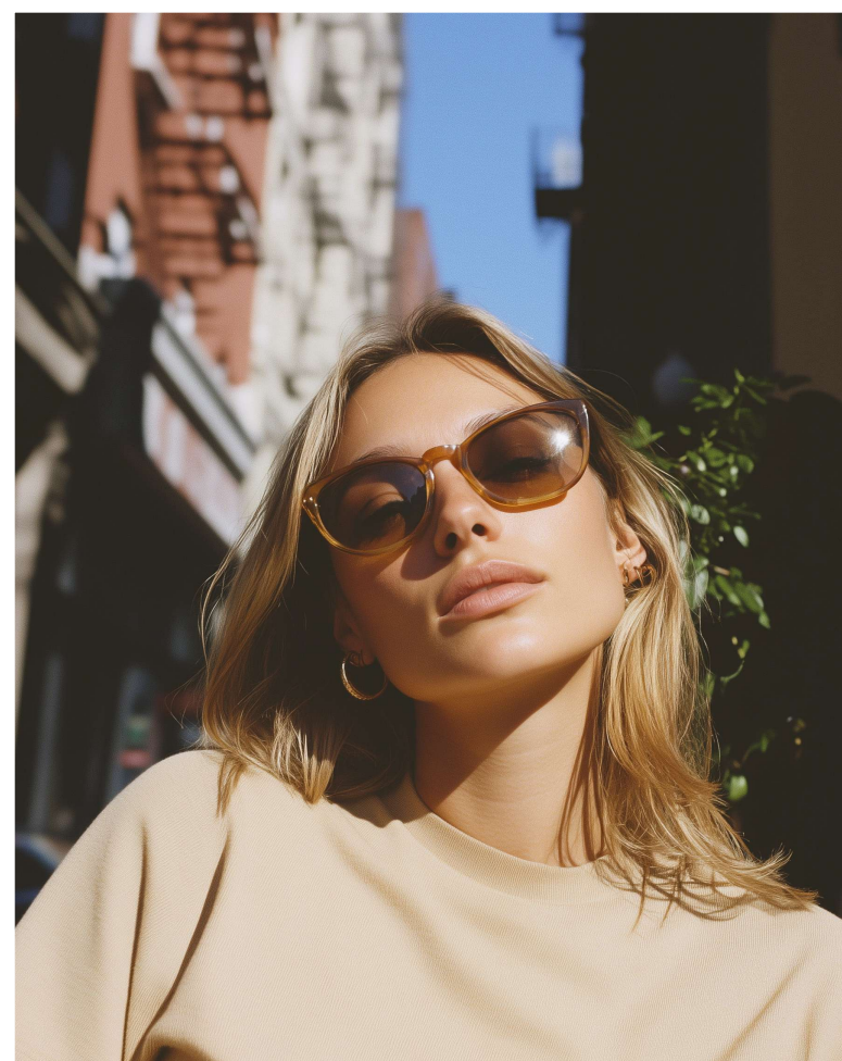
KODAK GOLD 100