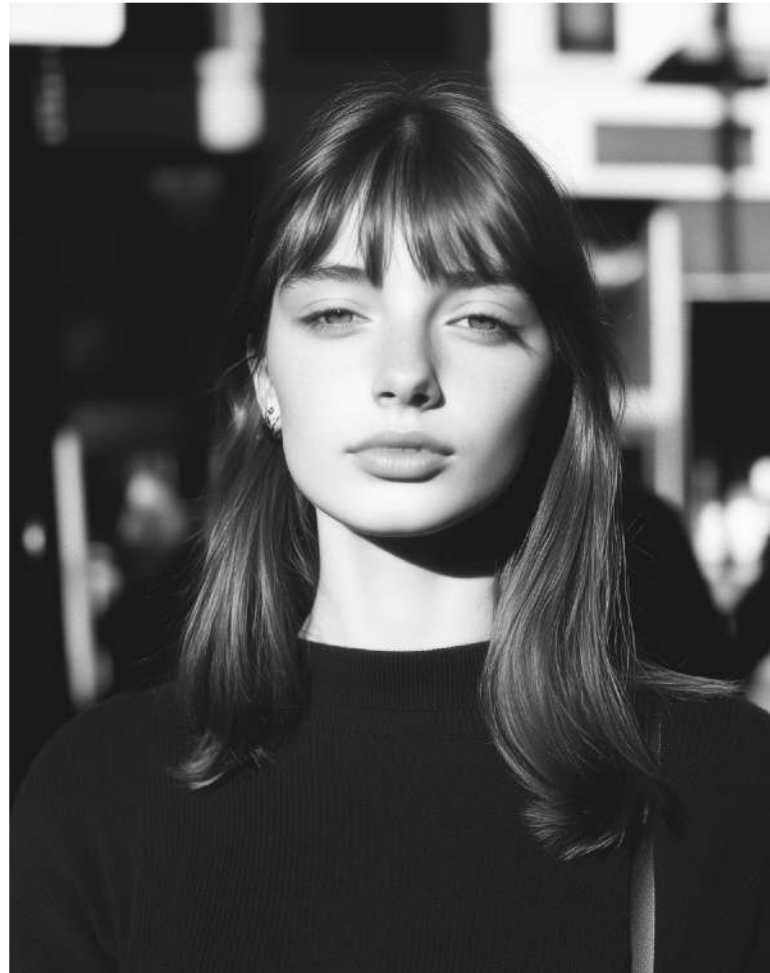
KODAK TRI-X 400