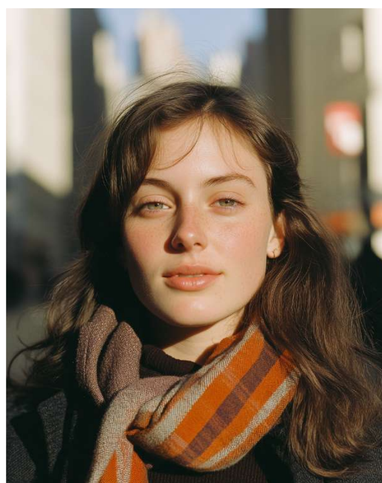
KODAK PORTRA 160