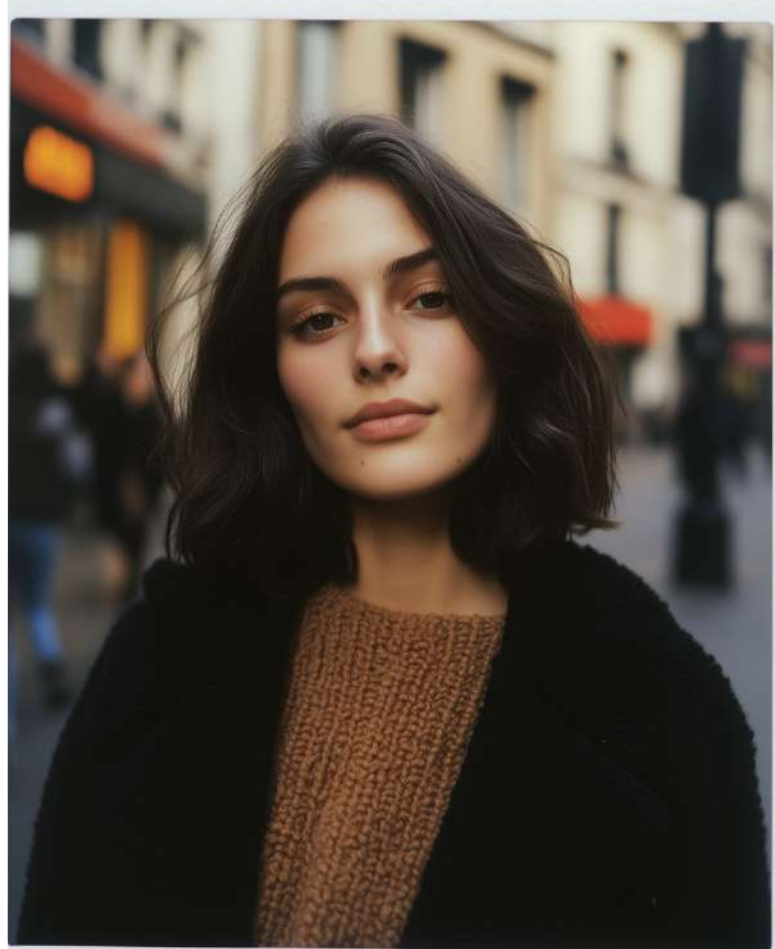
FUJIFILM INSTAX MINI