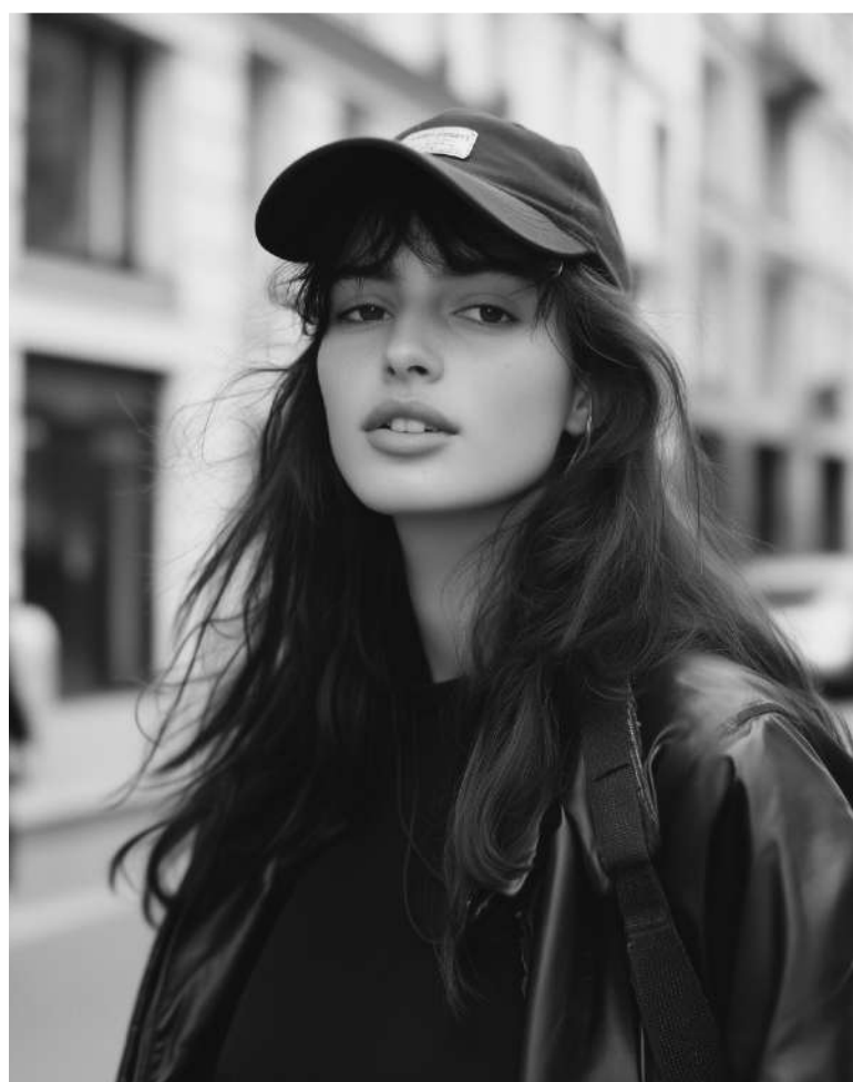
ILFORD XP2 SUPER 400