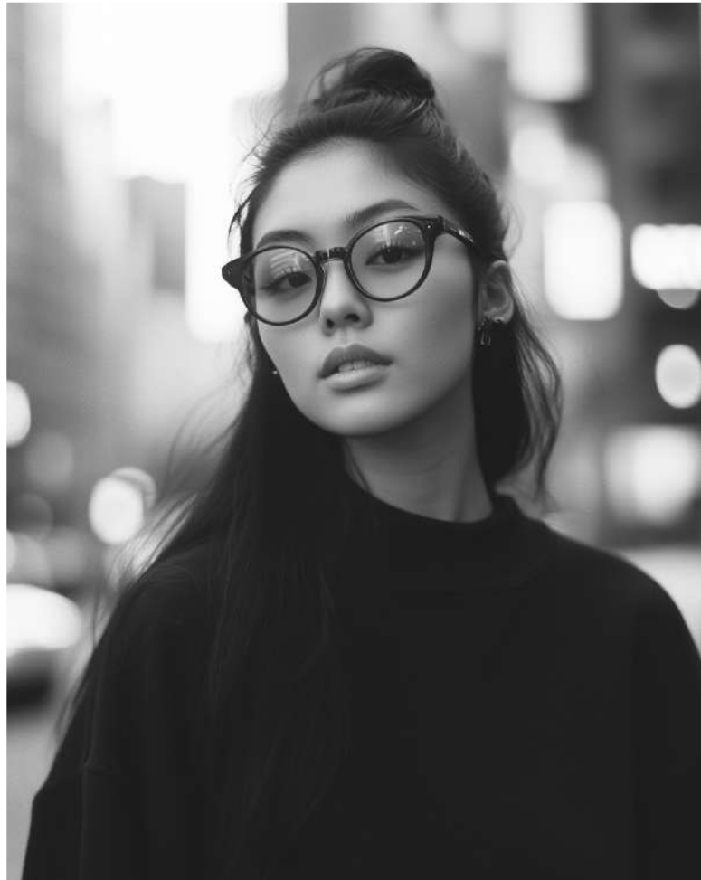
ILFORD HP5 PLUS 400