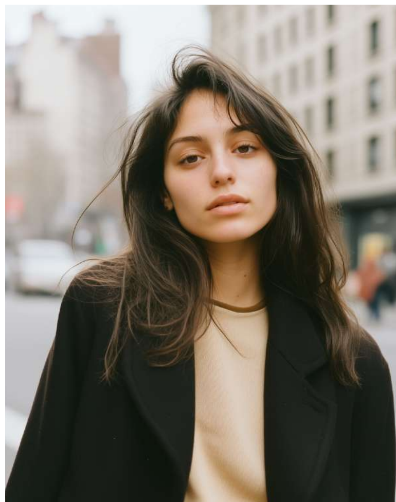
KODAK PORTRA 400