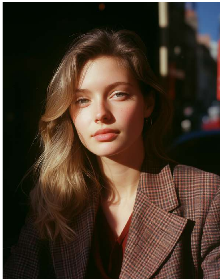
KODAK EKTAR 100