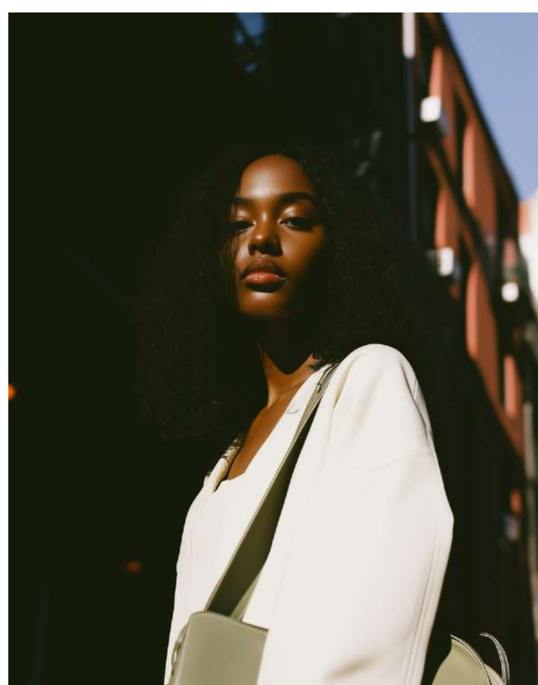
FUJIFILM PRO 400H