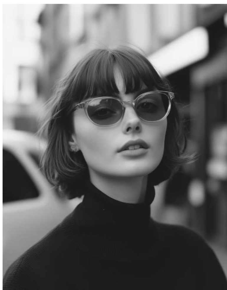
KODAK T-MAX P3200