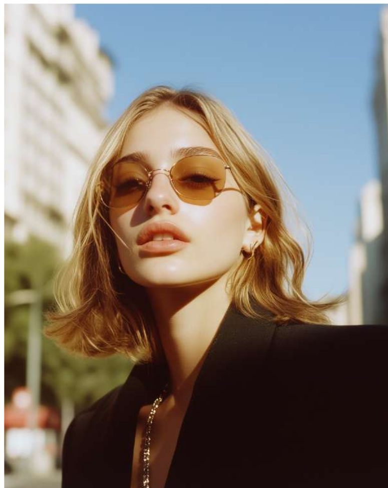
FUJIFILM SUPERIA 400