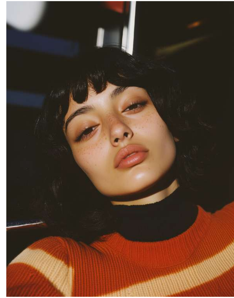
LOMOGRAPHY COLOR NEGATIVE 800