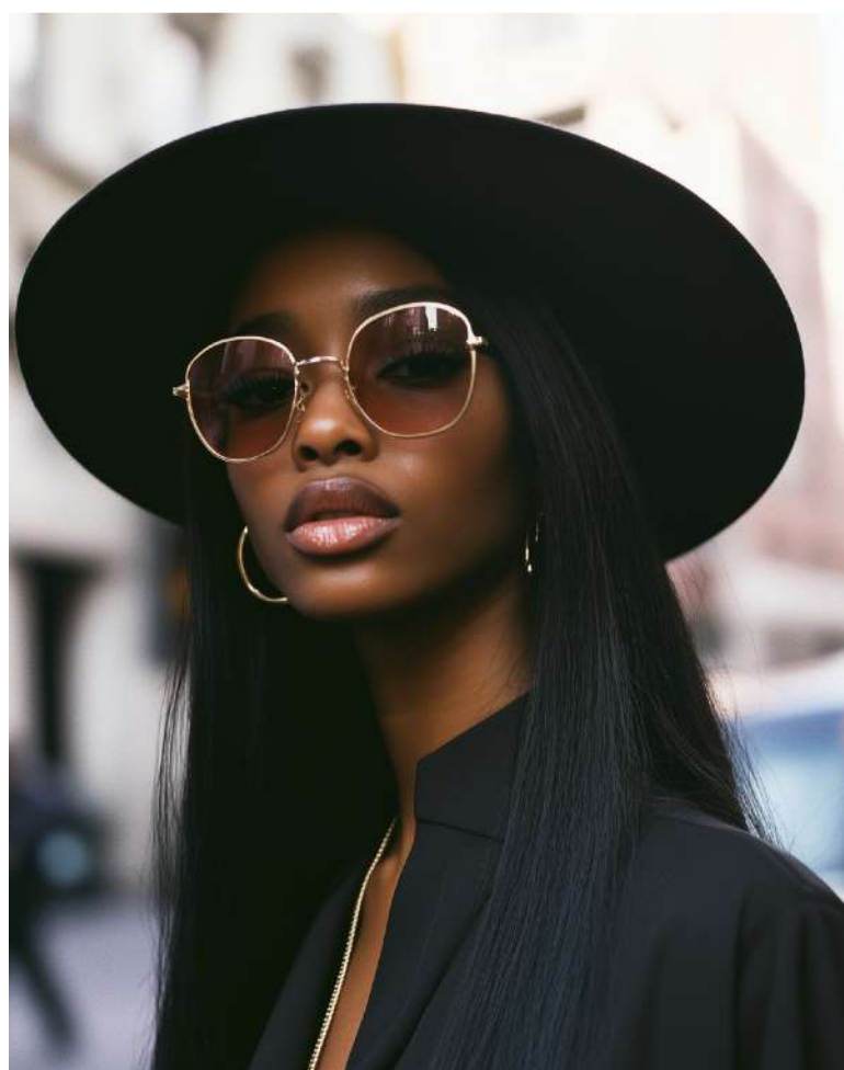
KODAK GOLD 200