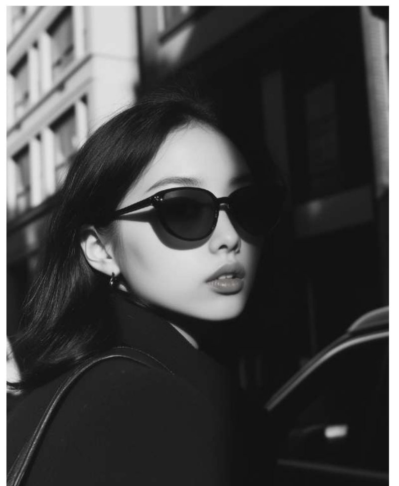
ILFORD FP4 PLUS 125