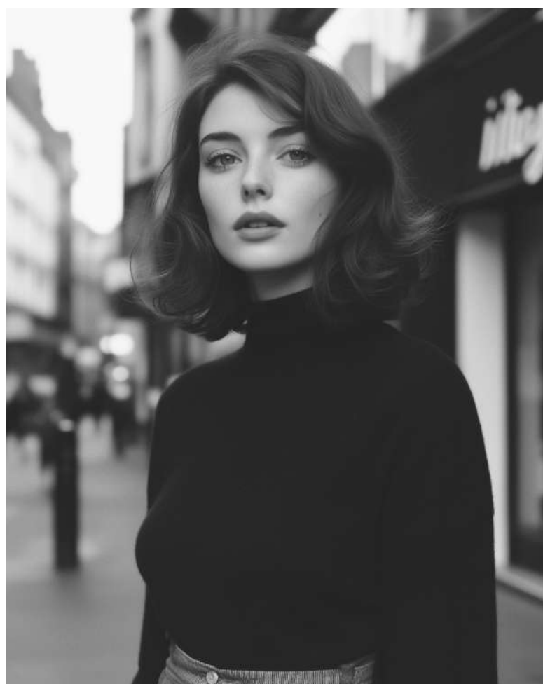
ILFORD DELTA 100