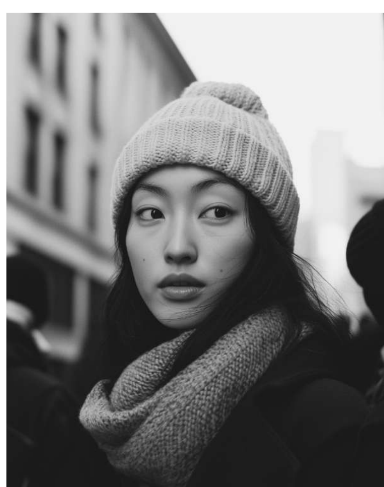
FOMA FOMAPAN 100