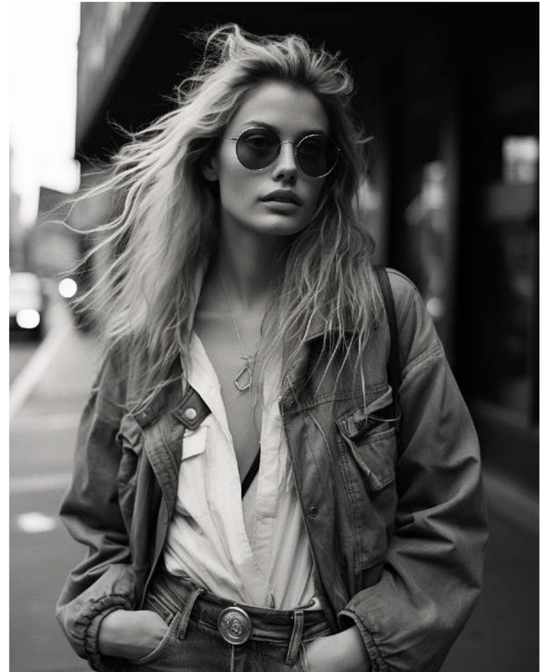
ILFORD DELTA 3200