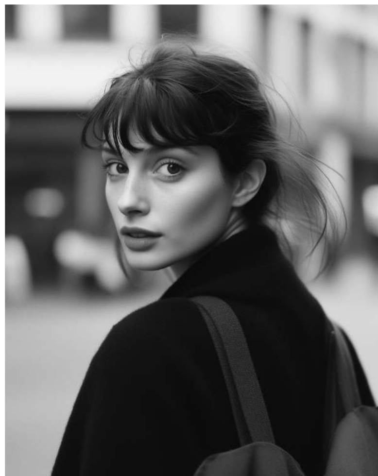
ILFORD SFX 200