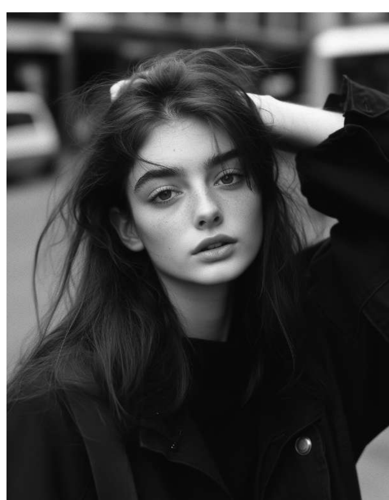
KODAK T-MAX 100