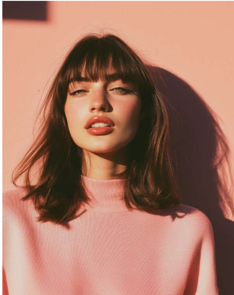
ADOX COLOR IMPLOSION