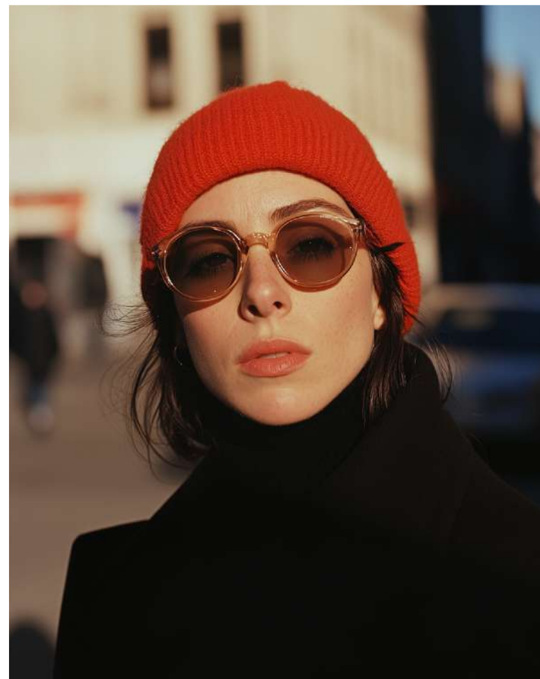
FUJIFILM PROVIA 100F