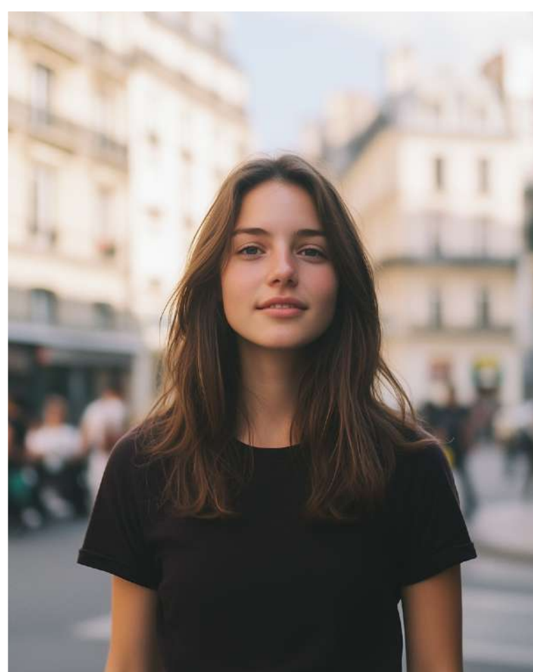
FUJIFILM SUPERIA X