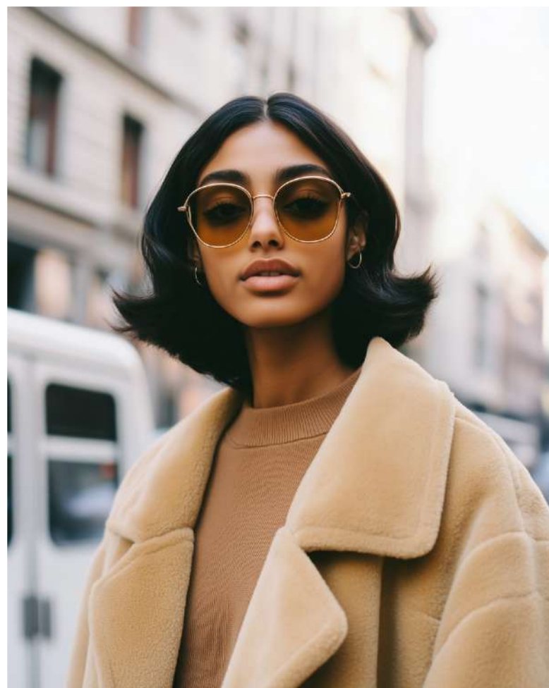
KODAK PORTRA 800