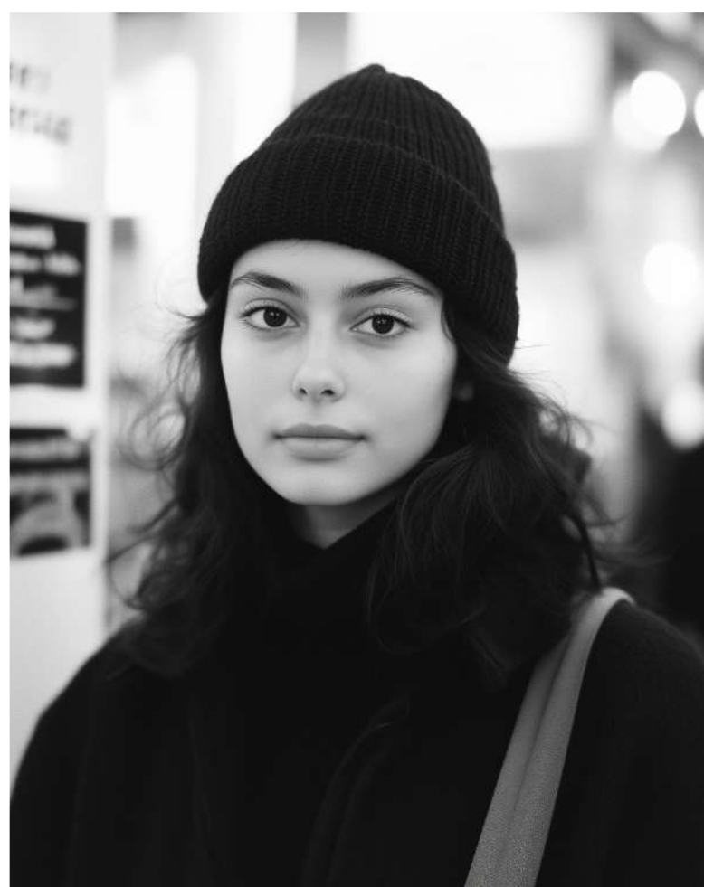
ILFORD ORTHO PLUS 80